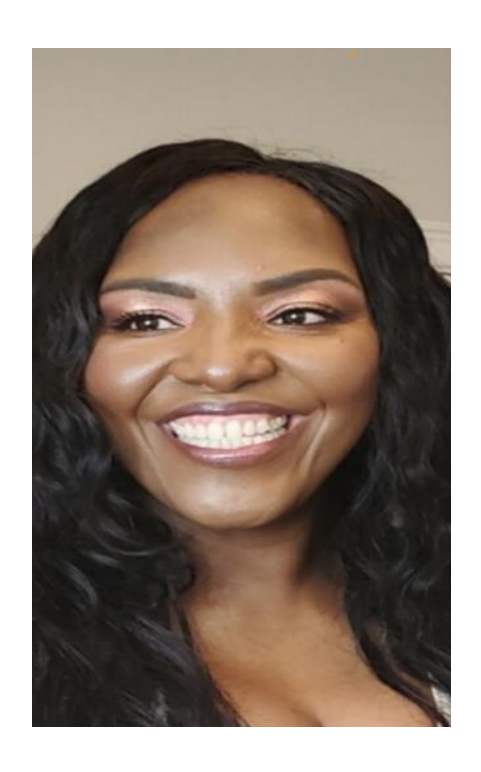
To the University Community—

University of the Potomac is committed to providing a safe campus environment, and we ask that everyone takes ownership of this goal. Over the years and in myriad ways, University of the Potomac has undertaken many important institutional efforts to address safety issues, including this publication. I urge you to review the information about campus safety measures, reporting crimes and other emergencies, as well as the procedures and policies designed to protect our University community. We have no greater priority than the safety of our students, faculty, staff, and visitors to our campuses, but a truly safe campus can only be achieved through the cooperation of everyone.