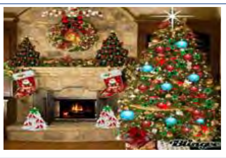
HAPPY HOLLIDAYS – UOTP STUDENT CHRISTIMAS PARTY DECEMBER 8<sup>th</sup>